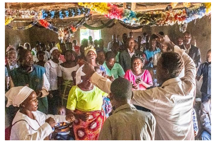
The church at Lengwe Chikwawa celebrating in dance and song

begged them to make a return visit later this year. The work is not limited to established church groups. The picture below shows villagers at Tsumba, close to the Village of Light, meeting outdoors to hear teaching, despite the relative chill of the cold season.