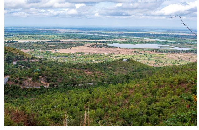
The district of Chikwawa with the Shire River

begged them to make a return visit later this year. The work is not limited to established church groups. The picture below shows villagers at Tsumba, close to the Village of Light, meeting outdoors to hear teaching, despite the relative chill of the cold season.