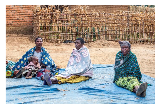
Women from Tsumba village sit on the ground sheltering under thin cotton chitenges from the cold

to many new places, and for the growth of the work generally.