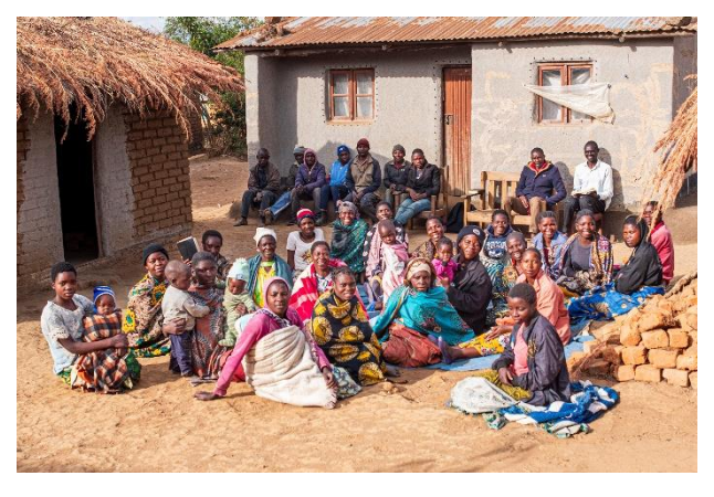
An outdoor meeting for Bible teaching at Tsumba village