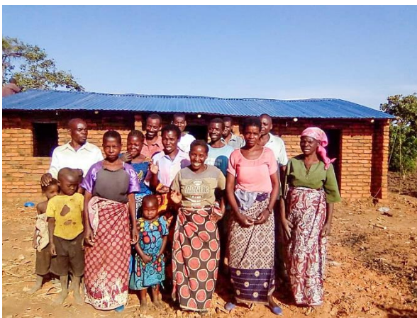
The new church building in the village of Mdzole in Lilongwe District in November 2020

churches to complete their construction of church buildings in more remote areas of the countries.