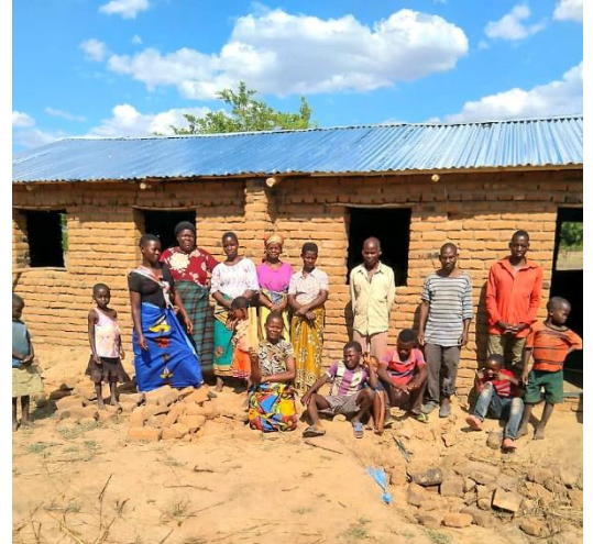
The newly finished church building in the village of Chidya in Dowa District in November 2020

There is so much else to report that is largely unseen. Days of fasting and prayer, individuals