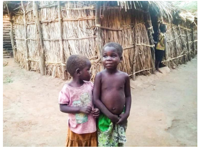
Children in the village of Lipu in Chikwawa District October 2020

The hope at this time is for heavy rain that will allow planting to begin. For the great majority of the planting seasons this century conditions have proved to be very difficult for Malawians to grow sufficient food to meet their needs. This past year has been no different. Once again through your generosity SaltMalawi has been able to make substantial donations to the church allowing her to buy food to help the most in need in their communities face the time of hunger that has now arrived.