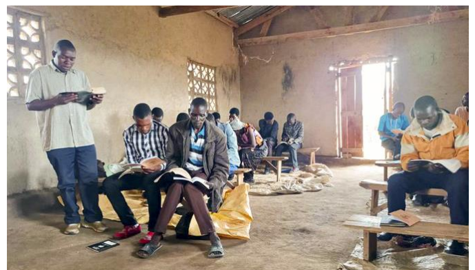
Discipleship training at the conference