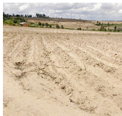
Dry soil before the rains

The local people had prepared their fields for planting, but the rains were late.