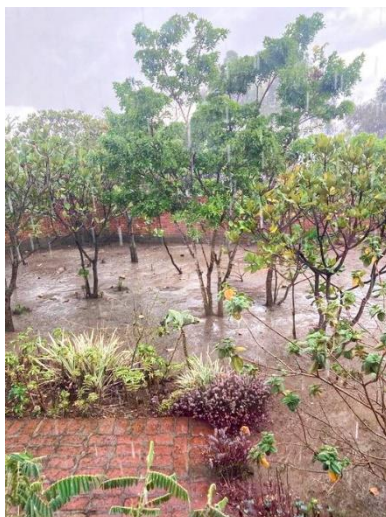
Welcome rains at the Village of Light

On New Year's Day there were reports of overnight rain so the planned leaders' conference was delayed as many people would be out planting crops. There is a national problem this year as many people cannot access or afford fertilizer. There could be a poor harvest regardless of rainfall.