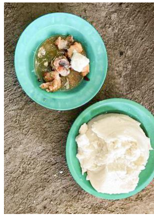
Chicken & Nsima