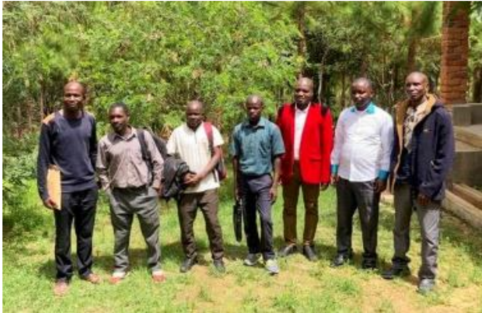
The CDJ Trustees