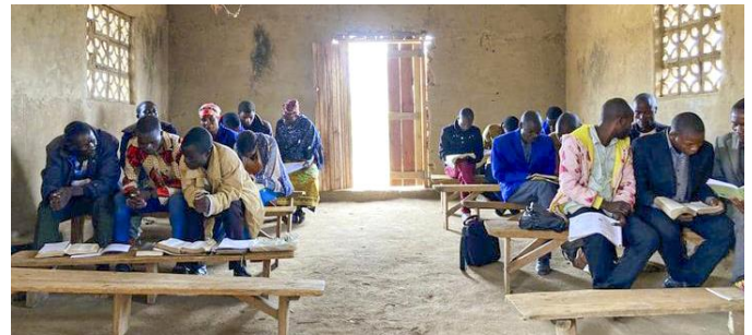
Discussion groups at the leaders' conference

On the Monday a leaders' conference began.