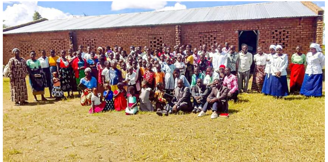
The church at Kasungu on Easter Sunday