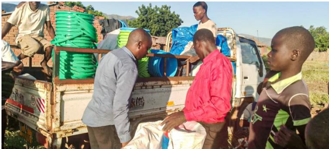
Delivery of aid to the south

The high cost of fertilizer is now out of reach of many ordinary families so crop yields this year have been far below normal. People have harvested what little maize they have grown even though normally they would have waited longer for the maize to dry. This is also a response to thieving in their fields. There are families in villages near to the farm in Malawi where they have already eaten what little they did manage to harvest and now face 9 months of hunger ahead.