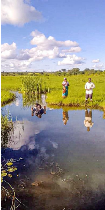
Baptisms at Kasungu on Easter Sunday