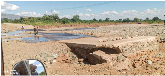
Some of the devastation caused to the roads in the south of the country by Storm Freddy

Malawi is suffering from severe shortages at the present time – shortages of fuel, food and fertiliser. There have been problems with drought in the north of the country and severe storms in the south.